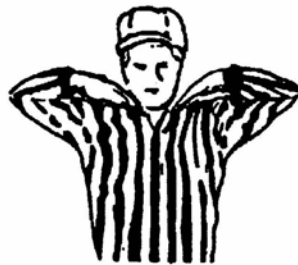
Illegally Touching the Ball