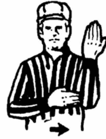
Illegal Offensive Screening - Illegal Pick