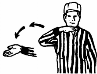
Re-entry of the Crease