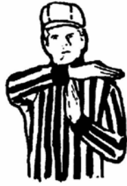
Tech Foul - 30 secs