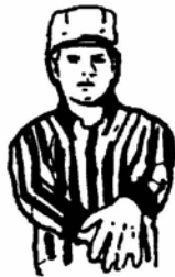
Withholding the Ball