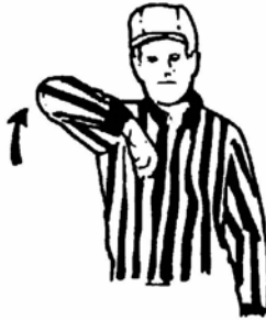
Illegal Body Check