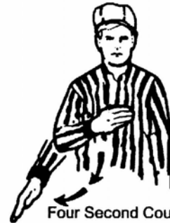
Four Second Count